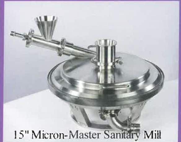
15" Micron-Master Sanitary Mill